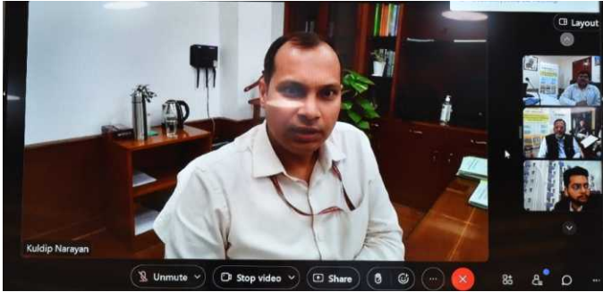
JS&MD (HFA) during the LHP webinar