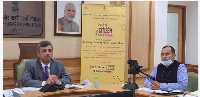
Secretary, MoHUA, & JS&MD, HFA attend webinar on post-budget announcements