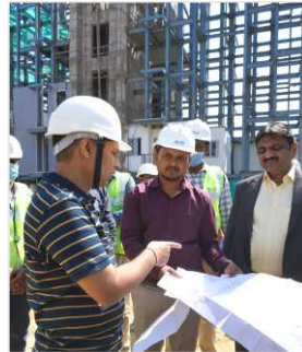
JS&MD, HFA during site visit to LHP Lucknow