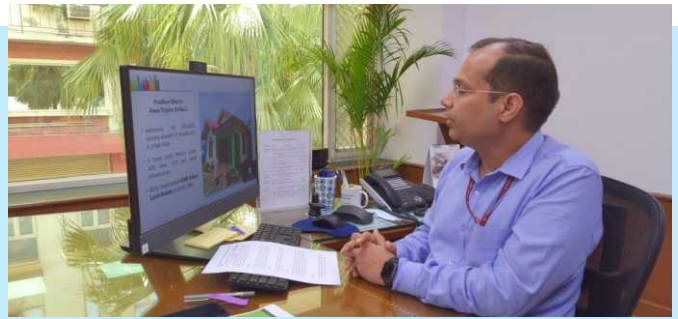
JS&MD, HFA attending the 13 th Indo-Japan Joint Working Group Meeting