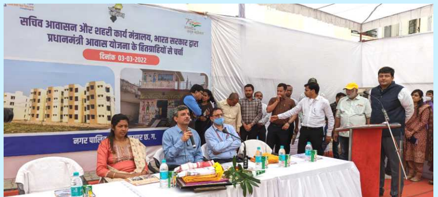
Secretary, MoHUA during interaction with beneficiaries at AHP project in Raipur