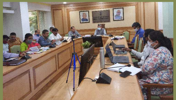
Secretary, MoHUA and other officials during the 59 th CSMC meeting

He reviewed the pace of completion of houses in the States and directed the officials to expedite the grounding and construction process. Secretary, MoHUA, also reviewed the revision of projects and performance of the participating States with respect to the Mission.