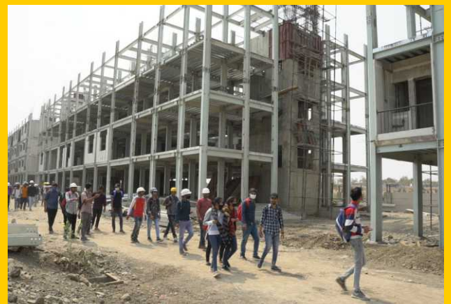
On site training session for Technograhis at LHP Indore

Similarly, on-site session was organised for students of Anna University at LHP Chennai. Students, engineers and other stakeholders were briefed about innovative construction technologies and their nitty-gritties. Meanwhile, a team of Task Force of Govt. of Uttar Pradesh also visited LHP Chennai for studying the use of new & innovative construction technologies.