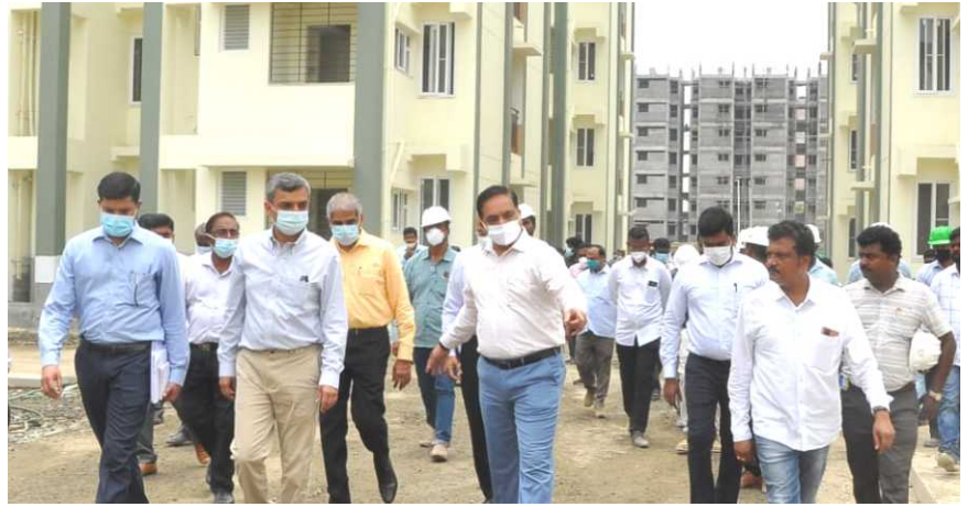
Secretary, MoHUA during visit to LHP Chennai